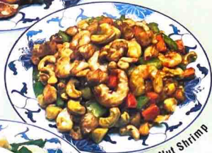
Cashew Nut Shrimp