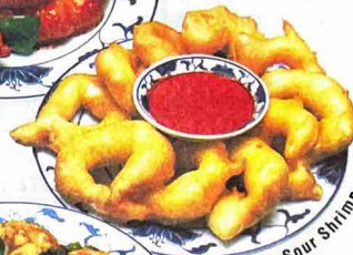
Sweet & Sour Shrimp