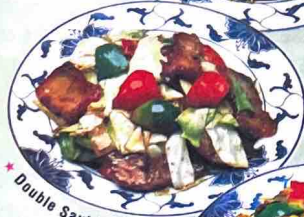
Double Sauteed Pork