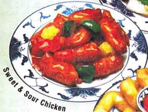
Sweet & Sour Chicken