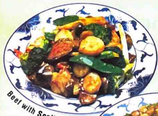
Beef with Scallop