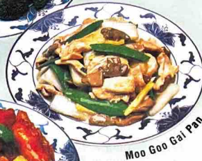
Moo Goo Gai Pan