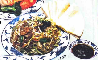
Moo Shu Pork